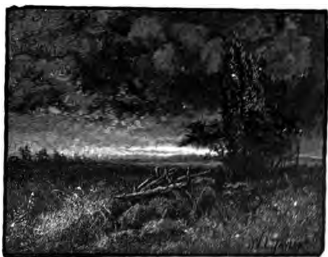
BEFORE THE RAIN. Page 43